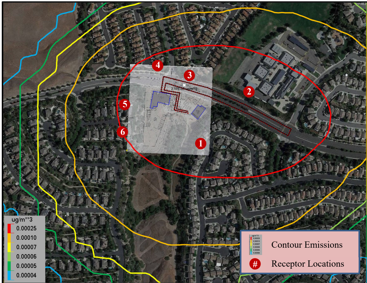
Figure 4-A: PM10–Truck Operations Idling/Movement AERMOD Plot