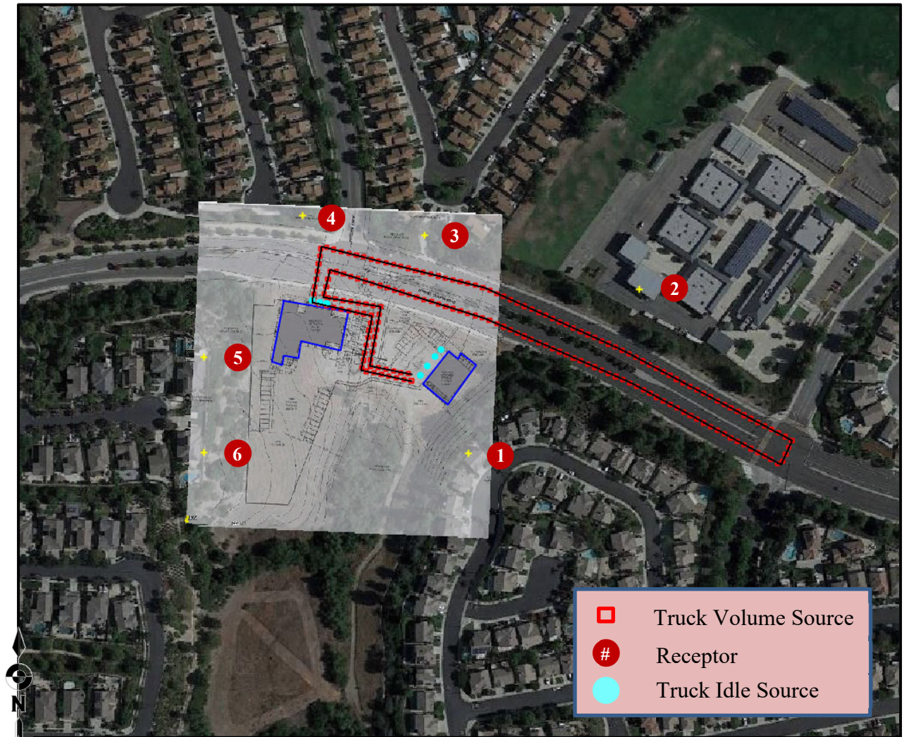
Figure 3-A: AERMOD Modeling Sources and Receptors - Onsite Operations